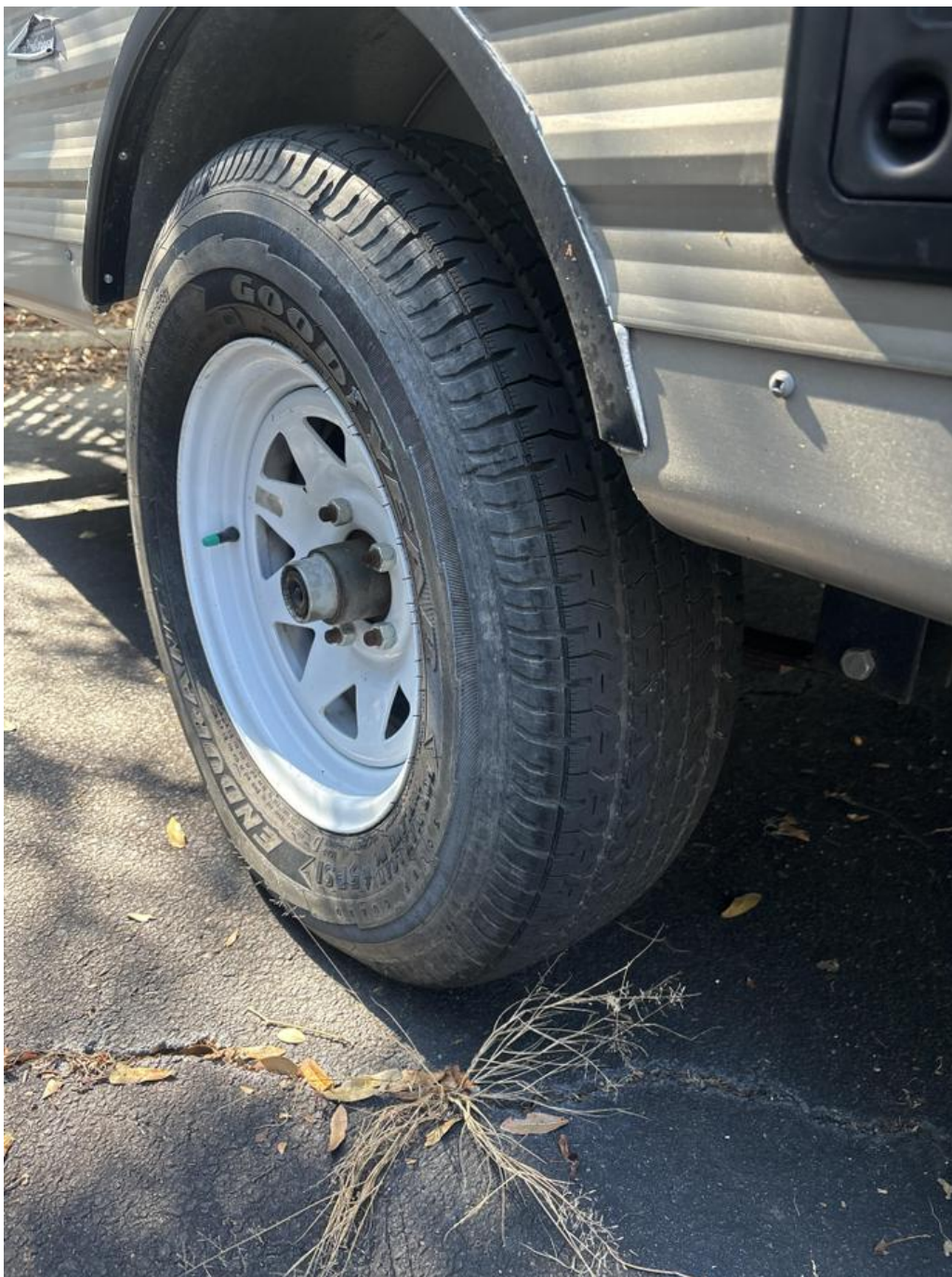
Picture of each tire tread